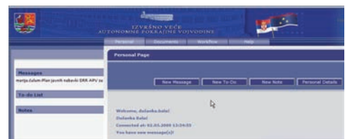
UI for the provincial government of Vojvodina