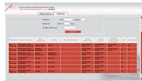
Activity history UI