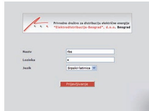
Login UI for Electro Distribution Belgrade